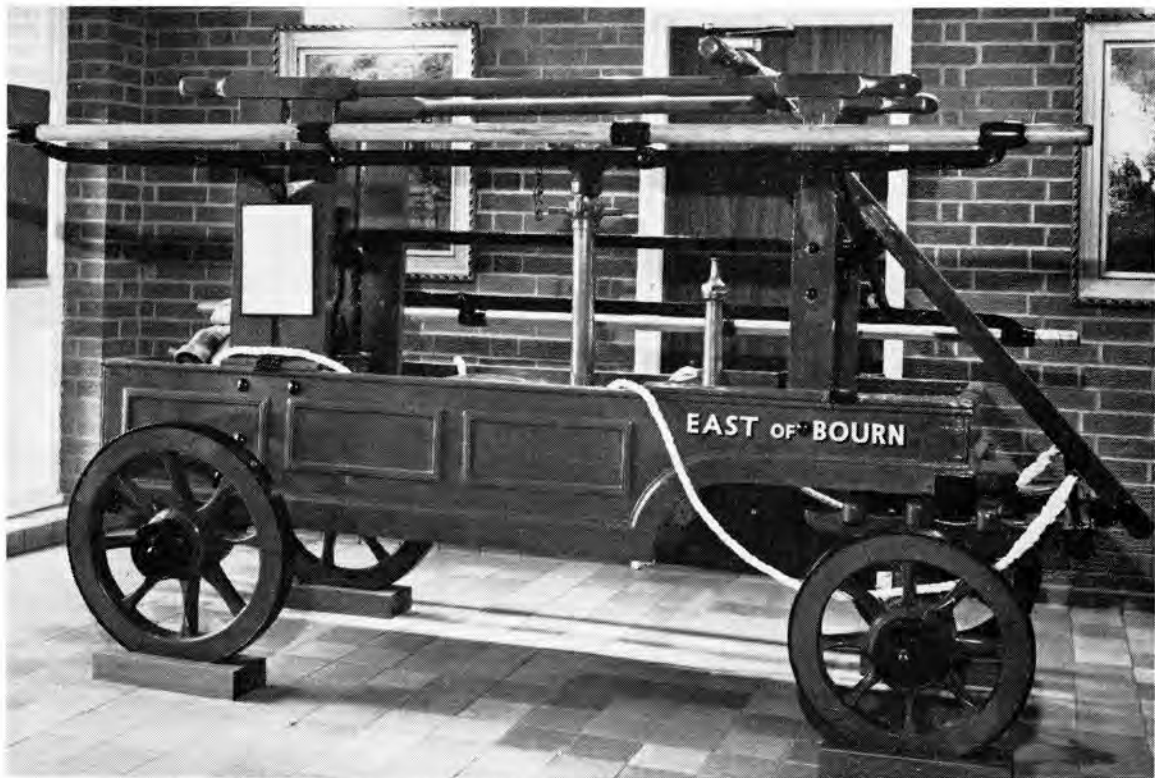
One of the manual pumps used in the "East of Bourn" between 1824 and 1850