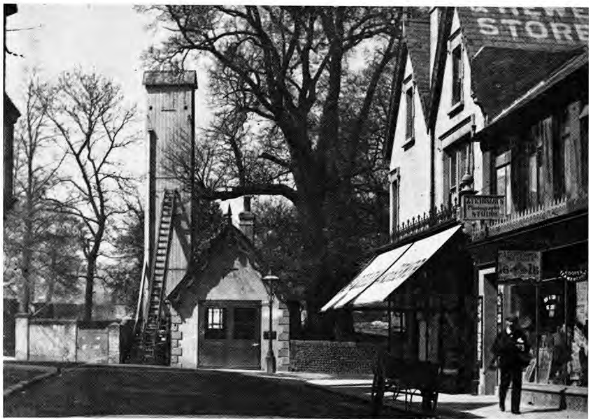
1898, The Fire Station in Grove Road

In 1883, Eastbourne was granted its Charter and became a Borough Council, the Council decided to establish a Volunteer Brigade maintained by the Rates, previously the cost of the Brigade had been borne by subscriptions. Additional premises were obtained to house the appliances and equipment and eventually fire stations were set up, one each at Grove Road, Cavendish Place, Old Town, Meads and Hampden Park.