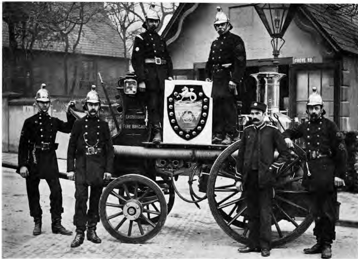
1899. Members of the Brigade with a "Shand Mason" Steamer